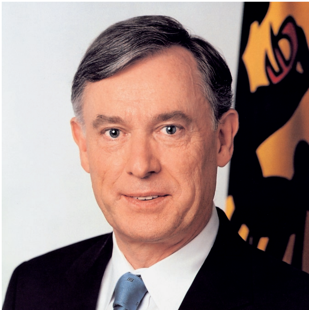
Germany's Federal President Horst Köhler