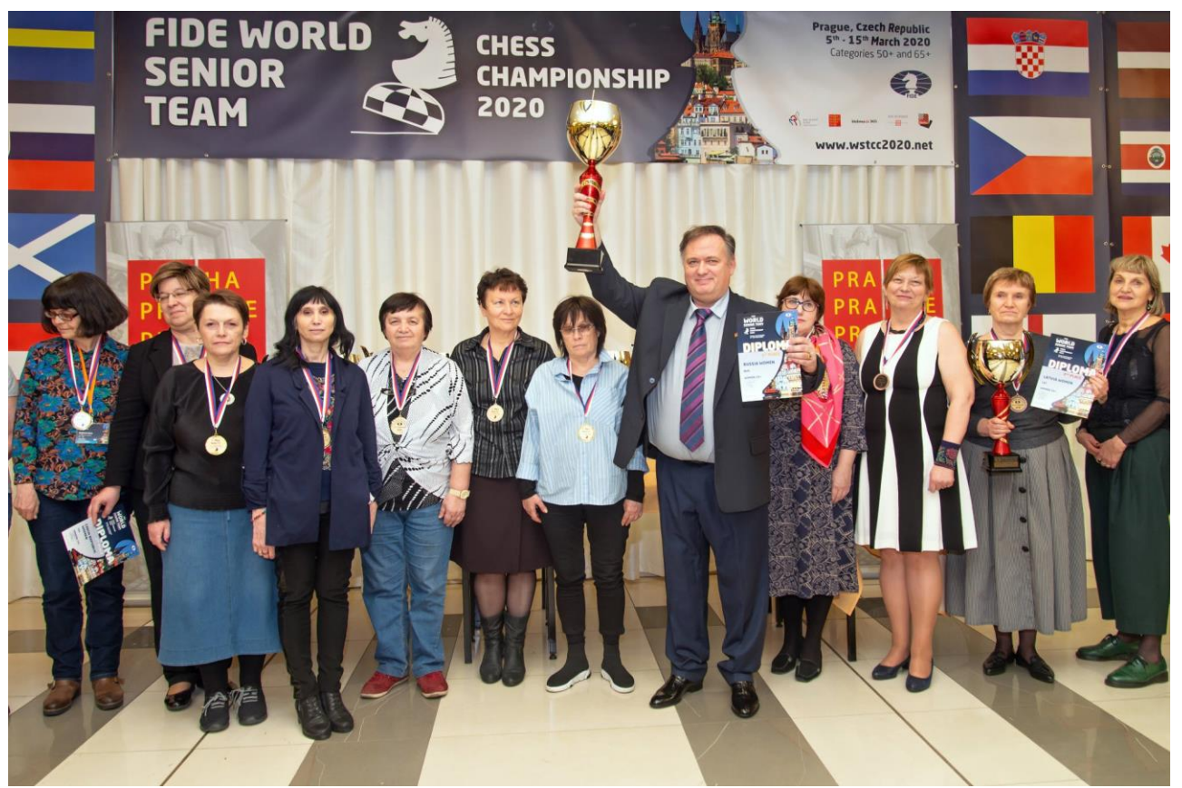
Winners of the women category above 50 years old at the World Championship in Prague 2020

The winning women team of the European Senior Team Chess Championship in the women category +65 receives the title "European Senior Team Champion 2021 in the women category +65"