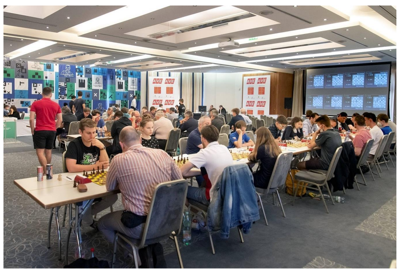
Playing hall of the Giovanni hotel