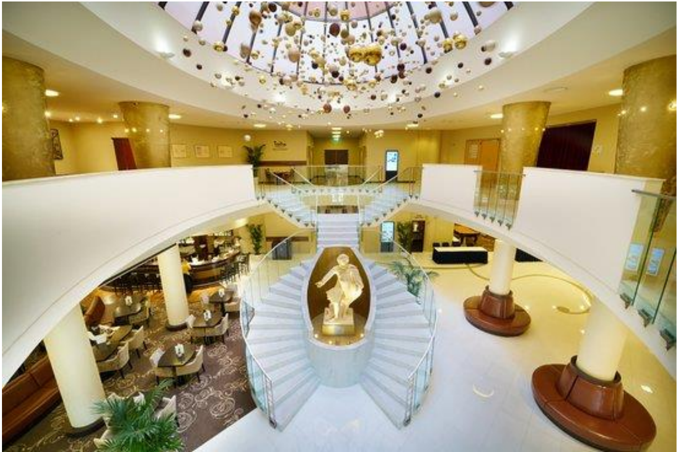
Entrance hall of the Giovanni hotel