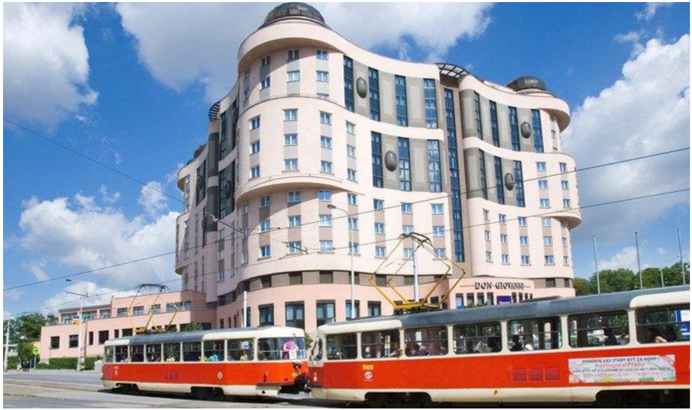
Don Giovanni hotel

Parking in the underground area of the Don Giovanni hotel for participants of European Championship for special price 250 CZK (10 EUR) /day